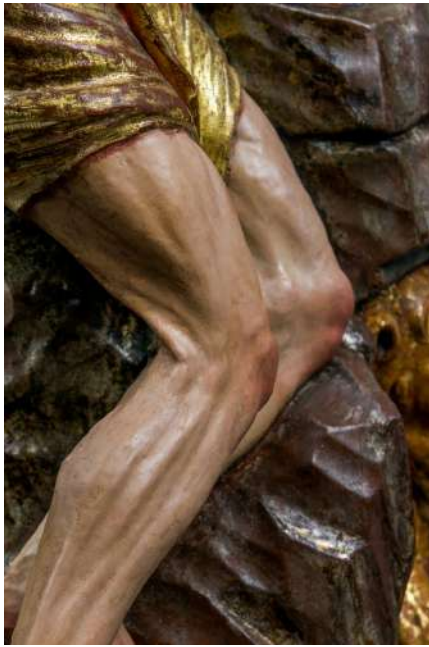
Fig. A6 Juan de Valmaseda, Saint Jerome , IOMR Collection