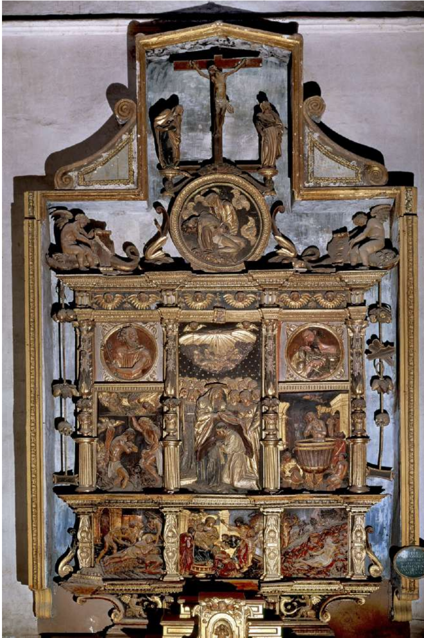
Fig. 6. Juan de Valmaseda, Altarpiece of the "Capilla de San Ildefonso", Cathedral of Palencia.

The 1530 decade, to which our St Jerome corresponds, marks the highest development of Valmaseda's style; when his work reaches a synthesis between his underlying Gothic background, loaded with its strong expressivity, and the Italian influences filtered by Alonso Berruguete's and Diego de Siloé's interpretations. The Masterpiece of this period is without any doubt the altarpiece in the chapel of San Ildefonso of Palencia Cathedral (Fig 6) , of markedly strong Siloesque characteristics in its smooth composition where Valmaseda combines in a masterly way medallions with figures in contraposto so that the scene seems to acquire an almost musical rhythm. We must draw attention to the magnificent relief work of Saint Jerome with its meticulous pictorial technique, whose lion is very similar to the one of our sculpture (Fig A7) and the beautiful relief representing a nativity with the Wise Kings (Fig 7) . The medallion, however, which crowns the altar-piece, representing the "Pietà", recalls to us the other "Pietà" which Alonso Berruguete in 1529/1530 did for the chapel of the Colegio de Santiago de Fonseca in a strong Michelangelesque spirit, specially in the way Christ lets Himself fall into Our Lady's lap; though, in Valmaseda's case, taking the form of an arabesque with a certain Gothic mannerism.