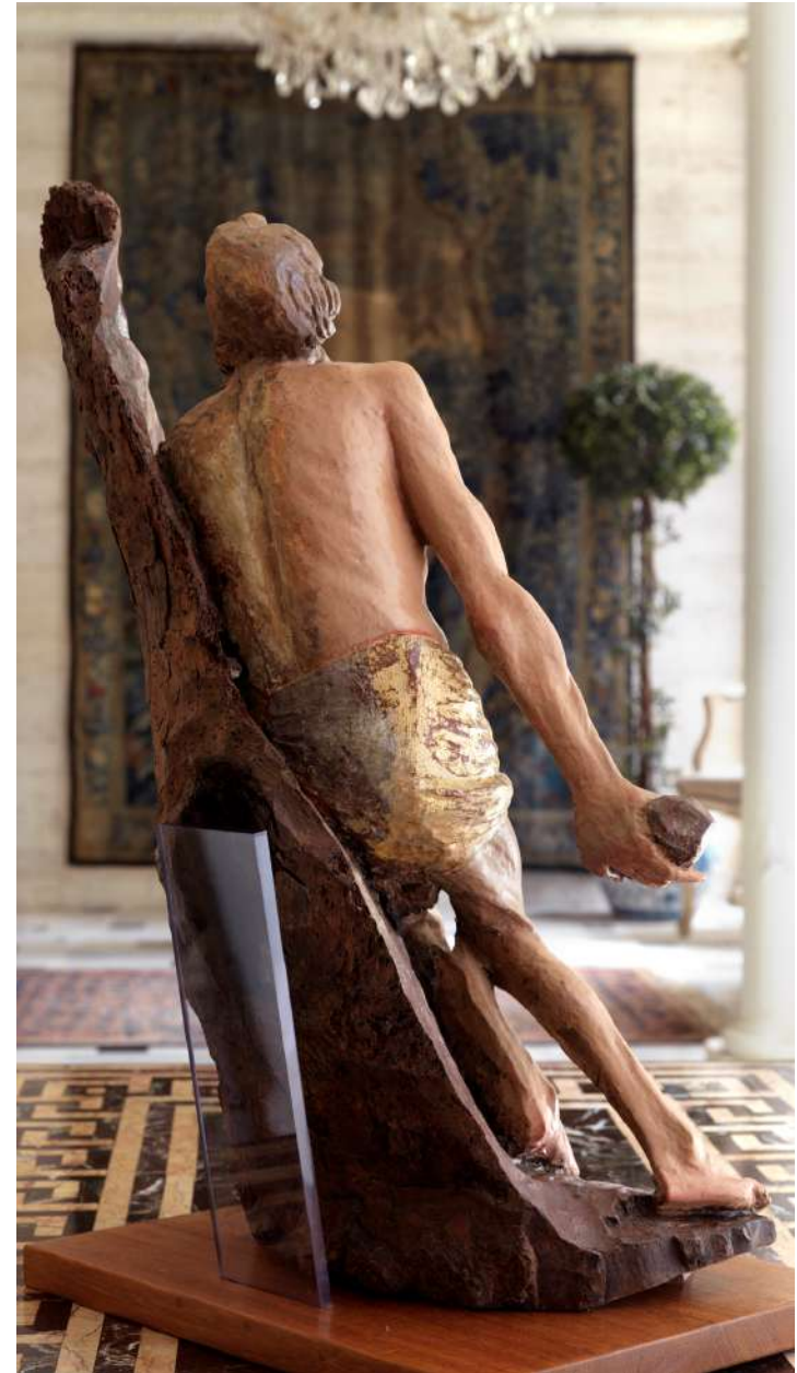
Fig. A11 Juan de Valmaseda Saint Jerome , IOMR Collection.

Here lies another of the great achievements of the sculpture. By means of a mechanical rotation system, applied at the base of the sculpture, the spectator discovers unknown angles of the work which are incredibly beautiful: the sculpture seen side ways (Fig. A12) where the Saint appears virtually leaning on the rock, with only his hand and his mystical expression perceived; the vision of the Saint's back, perfect in its unfinished state and of a Greek elegance which ends in sketchily rendered legs folded in an almost symphonic movement. (Fig. A11) Lastly, when we contemplate the reverse side of the sculpture, the piece shows there all its modernity as the walnut wood trunk, shaped like a flint stone, gains as the protagonist, and St. Jerome's face scarcely stands out revealing his unfinished part. (Fig. A13) Can there be any more modernity in this scene? How much it reminds us of Michelangelo (Fig. 14) and his slaves, how much we are moved emotionally by this struggle between the spirit and the material, between polished and unfinished, areas in this conflict produced by forms in their intent to free themselves, in this case, from a wooden trunk!