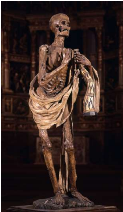
Fig. 8. Juan de Valmaseda Allegorical figure representing Death , Museo Nacional de Escultura de Valladolid.

We find ourselves facing a sculptor not well known in modern times who, however, has been able better than anyone else, to create compositions which became easily recognisable archetypes in his time, and which had great success in Castile during the first half of the XVI th century. Valmaseda creates various compositions which become canons during the Spanish Renaissance as are his Calvaries (Fig1) , his active Virgin Maries (Fig 2) who appear to dance with swaying motion, with the Saints (Fig3) ; his allegorical representations of death which influence so much Spanish XVII century sculptors (Fig 8) ; his childlike youths with rather feminine features, which our sculptor likes to repeat in his Saint Johns and his many San Sebastians which we see in Palencia Cathedral, in Santa Columba or in the Rodriguez Acosta collection (Fig.9) .