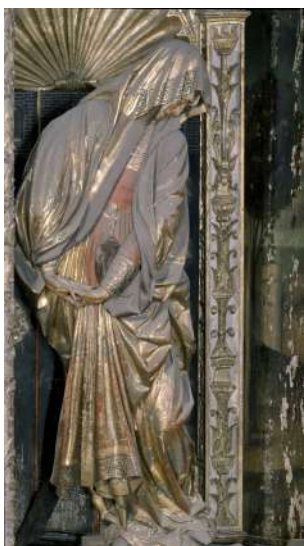
Fig. 2. Juan de Valmaseda, Our Lady , Calvary of the High Altar-piece at the Cathedral of Palencia.