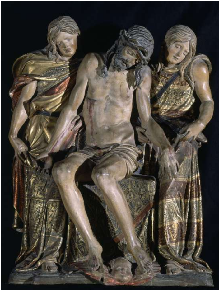
Fig. 4 Diego de Siloé, The Christ between angels , Altar-piece of Saint Ana, Cathedral of Burgos.