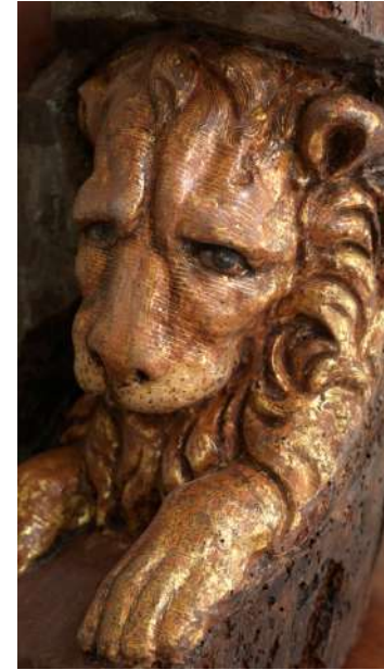
Fig. A7 Juan de Valmaseda Saint Jerome , IOMR Collection.

The work we are now studying represents a Saint Jerome in a state of ecstasy due to a supernatural vision of Christ; the scene is set in rocky surroundings, he holds in his hand a stone (Fig A5) and is accompanied by a Lion. (Fig A7) In this scene we observe strong Berrugueteque influences, above all, as Parrado indicates, in the composition “en serpentinata” and the unbalanced position of the Saint (Fig A9) . It presents analogies in design between this sculpture and the St Jerome by Siloé in the chapel of the Condestable of Burgos Cathedral (Fig.10) , specially due to the Saint’s firmly out stretched arm, the crouching position of his legs and the lion. All this makes us confirm for stylistic reasons the date of execution, in the decade of the 1530s, maintained by Parrado, which is when Valmaseda’s art reaches its highest quality, thus fulfilling excellently the fusion between his tardo-Gothic roots and the Italian influences of Alonso Berruguete and Diego de Siloé which, irritating ever more his strong expressionism, were now enrolled in a canon of beauty.