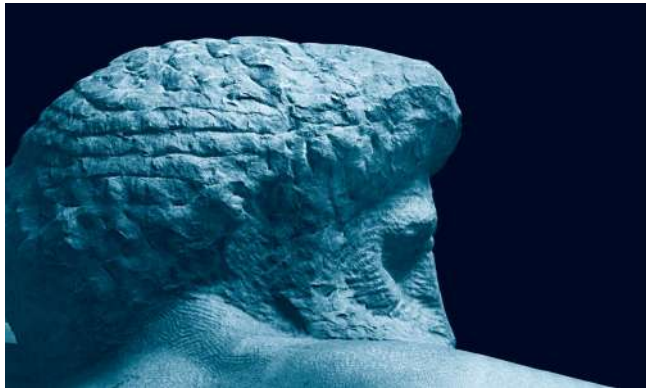
Fig. 14 Michelangelo Buonarroti, Tomb of Giuliano de' Medici (Circa 1530), San Lorenzo Basilica, Florence