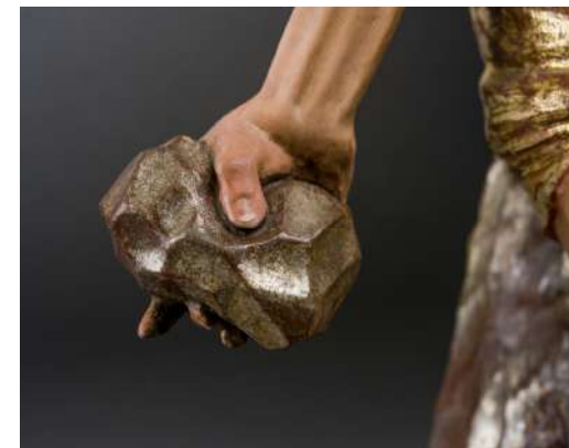
Fig. A5 Juan de Valmaseda, Saint Jerome , IOMR Collection

The work we are now studying represents a Saint Jerome in a state of ecstasy due to a supernatural vision of Christ; the scene is set in rocky surroundings, he holds in his hand a stone (Fig A5) and is accompanied by a Lion. (Fig A7) In this scene we observe strong Berrugueteque influences, above all, as Parrado indicates, in the composition “en serpentinata” and the unbalanced position of the Saint (Fig A9) . It presents analogies in design between this sculpture and the St Jerome by Siloé in the chapel of the Condestable of Burgos Cathedral (Fig.10) , specially due to the Saint’s firmly out stretched arm, the crouching position of his legs and the lion. All this makes us confirm for stylistic reasons the date of execution, in the decade of the 1530s, maintained by Parrado, which is when Valmaseda’s art reaches its highest quality, thus fulfilling excellently the fusion between his tardo-Gothic roots and the Italian influences of Alonso Berruguete and Diego de Siloé which, irritating ever more his strong expressionism, were now enrolled in a canon of beauty.