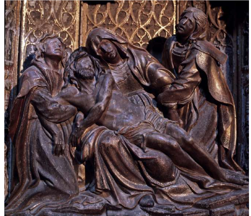
Fig. 5. Diego de Siloé or Juan de Valmaseda, Pietà , Iglesia de Santiago de la Puebla, Salamanca,.