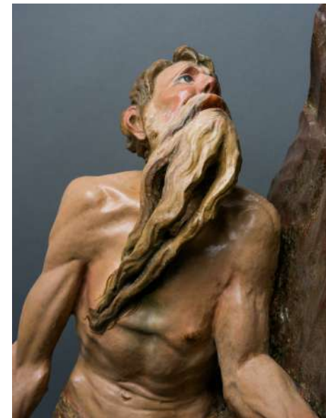
Comparison between the Saint Jerome (1530) by Alonso Berruguete, from the High altarpiece of the Church of San Benito, Valladolid, Museo Nacional de Escultura de Valladolid (Fig. 11) and the Saint Jerome (1530) by Juan de Valmaseda, IOMR Collection (Fig. A8).