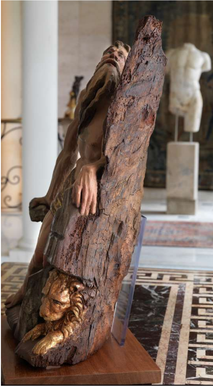
Fig. A12 Juan de Valmaseda Saint Jerome , IOMR Collection.