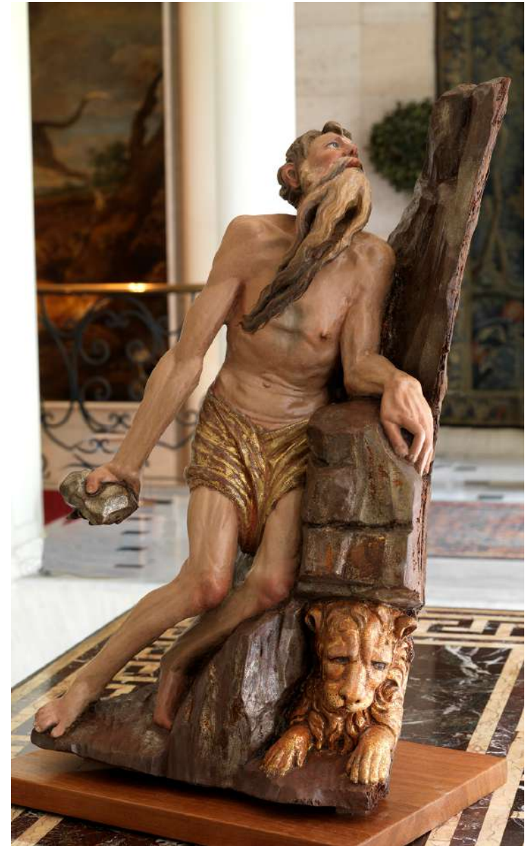
Comparison between the Saint Jerome (1522) by Diego de Siloé, capilla del Condestable, Cathedral of Burgos (Fig. 10) and the Saint Jerome (1530) by Juan de Valmaseda, IOMR Collection (Fig. A1).