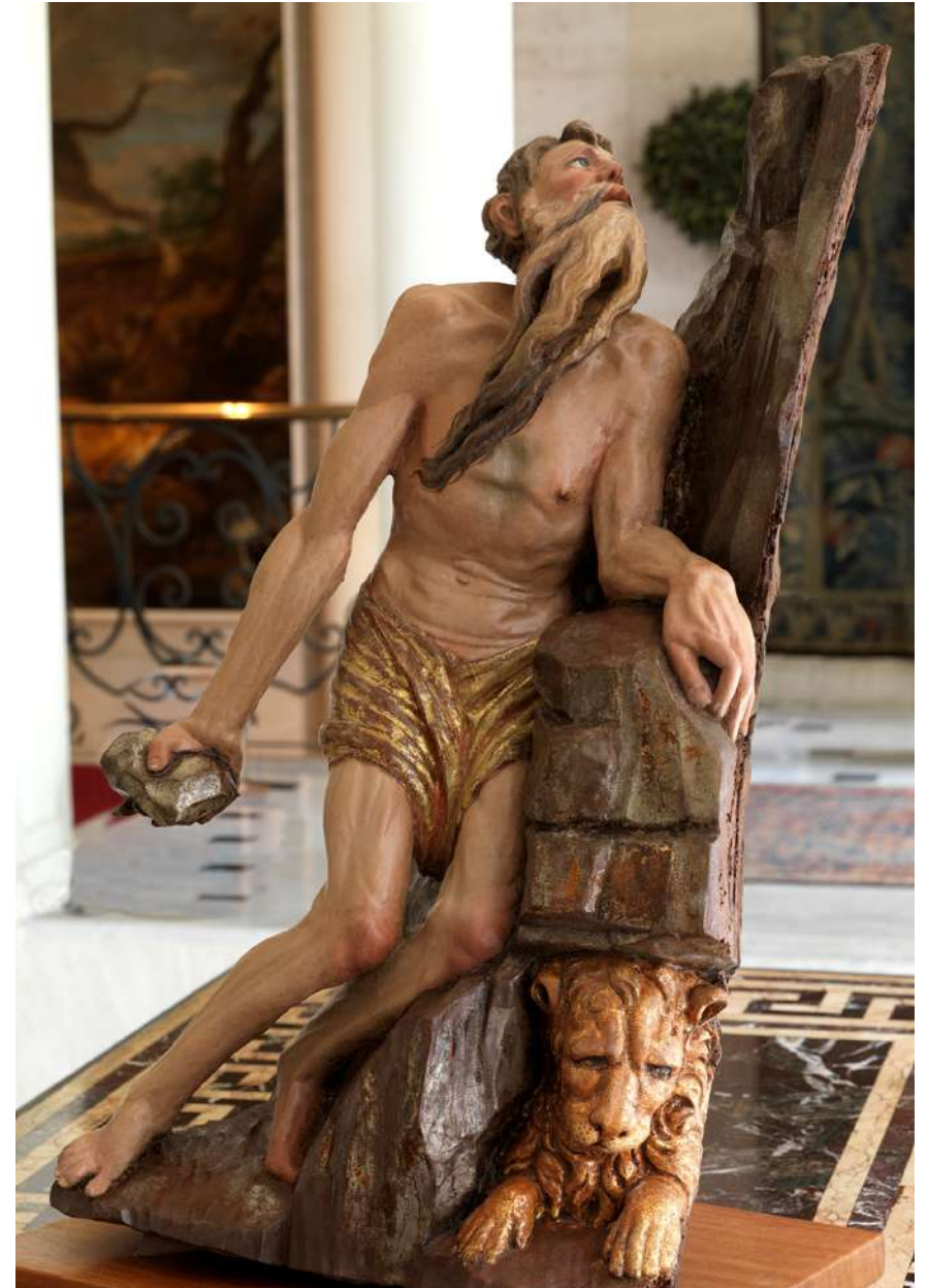
Fig. A1 Juan de Valmaseda , Saint Jerome , Circa 1530, : Polychrome Wood, 73 x 41 x 30 cm, XVI century Spanish School. Exhibited at the Cathedral of Toledo (2017), IOMR Collection.

Preview of the upcoming book "Treasures of Spanish Renaissance Sculpture: The birth of the Spanish Manner", to be published October 2019. www.iomr.art