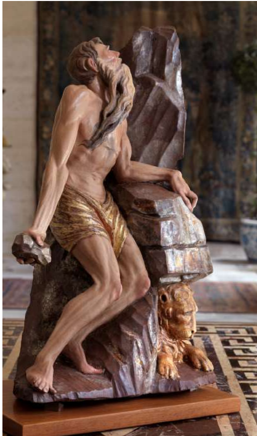
Fig. A9 Juan de Valmaseda Saint Jerome , IOMR Collection.

Finally, if we compare it with the St Jerome of the Church of San Francisco at Medina de Rioseco, by Juan de Juni, there we would find ourselves facing a work of comparable expressivity, imbued by an early baroque style. Valmaseda offers us a composition captivated by the sense of movement worthy of Michelangelo's slaves or Miron in his "discipolo", based on a simple sloping diagonal. On such an evident simplicity lies the beauty of the sculpture. (Fig. A11)