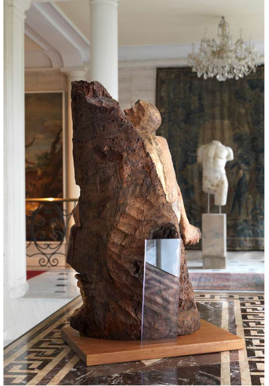
Fig. A 13 Juan de Valmaseda, Saint Jerome by, IOMR Collection