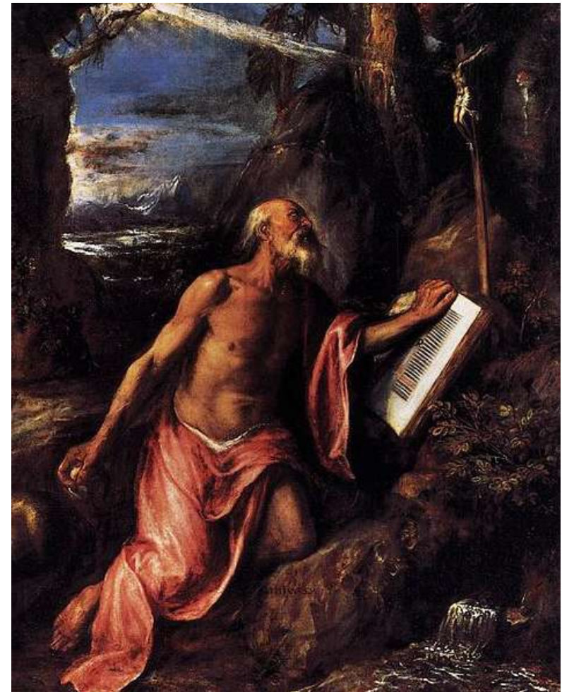
Fig.12 Titian, Saint Jerome in Penitence (1575), Nuevos Museos in the El Escorial.