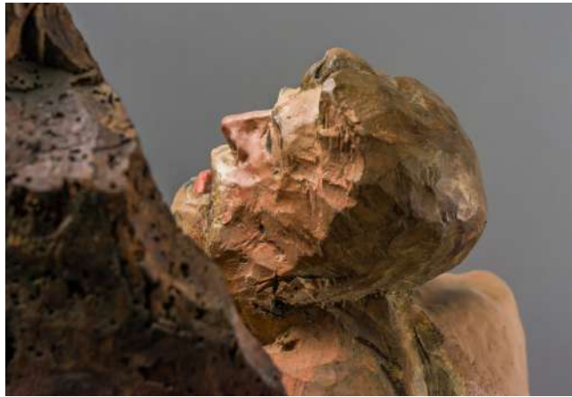
Fig. A16 Juan de Valmaseda, Saint Jerome (1530) by