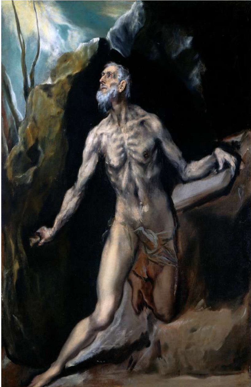
Fig. 13 El Greco. Saint Jerome Penitent (1614). National Gallery of Art.