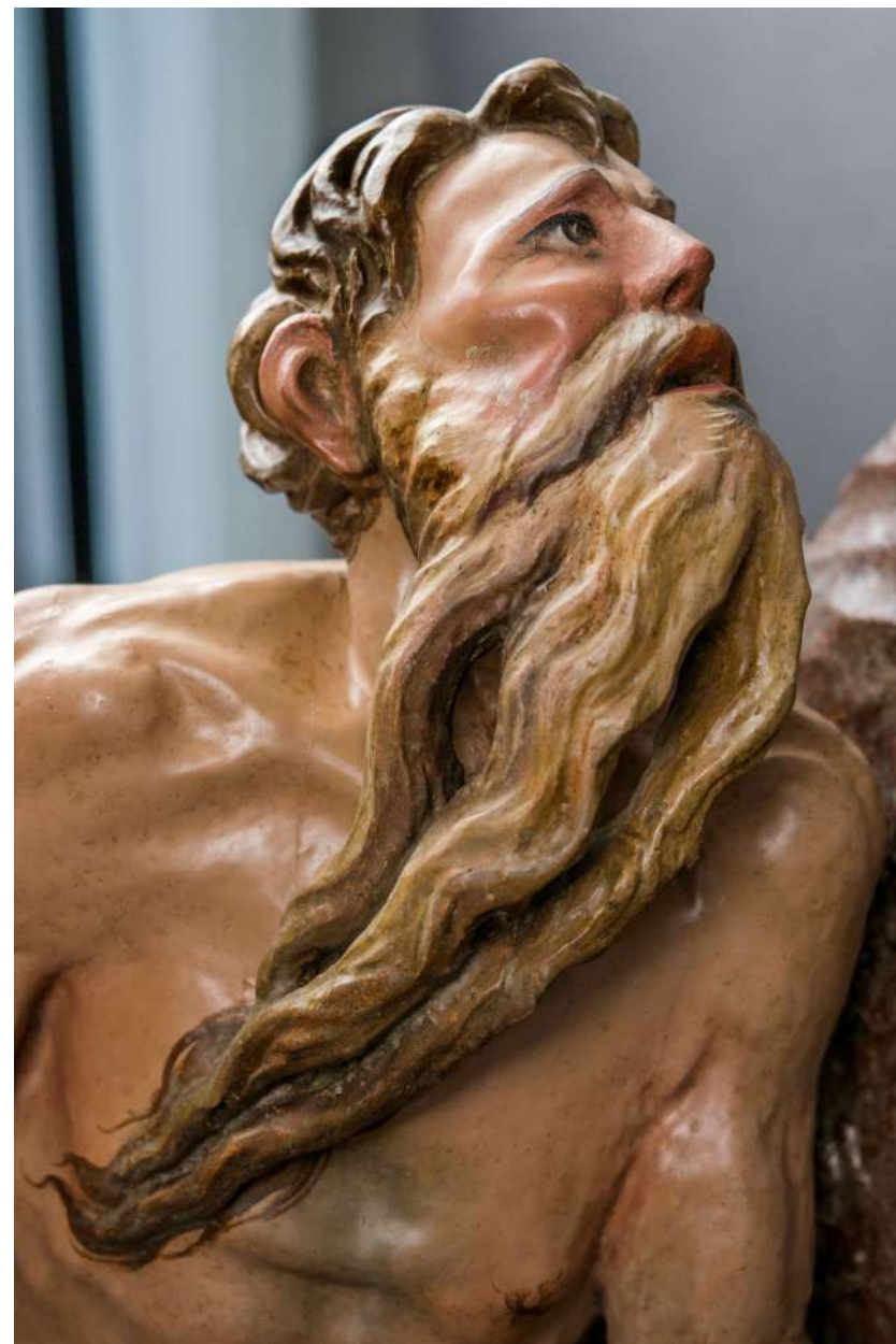
Fig. A3 Juan de Valmaseda Saint Jerome , IOMR Collection,

We, however, already observe specially in the Calvary of Palencia Cathedral, the touches of inspiration which make Juan de Valmaseda stand out as a genius with an immediate and evident artistic style completely of his own. He creates a canon of Calvary in which he combines in a masterly way the absolute rigidity of Christ with the sensational movement of Our Lady (Fig.2) in a delicate contraposto to the Saint John (Fig. 3) from whose half-open mouth drips an overwhelming sorrow which reminds us of the newly discovered Laocoonte . We shall see something of all this later in Alonso Berruguete in his altar-piece of Mejorada de Olmedo and in the one of San Benito in Valladolid. This artistic formula which was so striking must have been very successful in view of the number of Calvaries attributed to him. We also find other touchstones which reveal his sculptor's hand such as a straight nose, lean faces, prominent cheek bones, pointed beards and hair which falls in tangled locks, feet with outstretched toes and hands calmly crossed. All this treated in a succinct, expressionist manner, as it is executed in our St Jerome . (Fig A3)